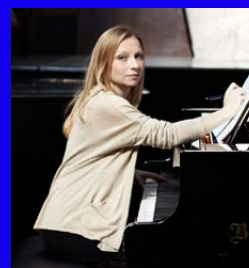
2019/20 客席作曲家 Guest Composer 貝蕾爾 Charlotte Bray

(* 入選的作曲家必須出席 Selected composers are required to attend these events)