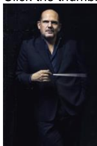
Jaap van Zweden

Click the thumbnails to download press images [Or hold Ctrl then click to open the file]