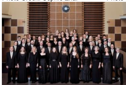
Netherlands Radio Choir