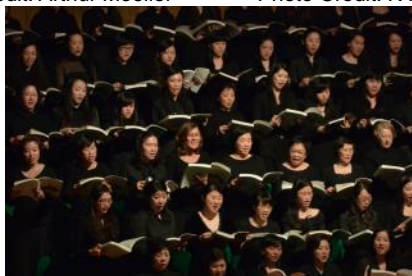
Hong Kong Philharmonic Chorus