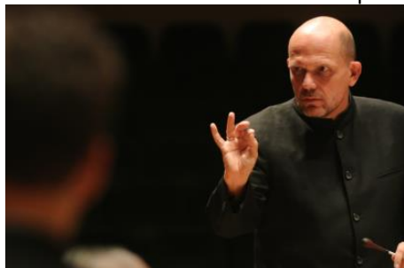
Jaap van Zweden

Click the thumbnails to download press images [Or hold Ctrl then click to open the file]