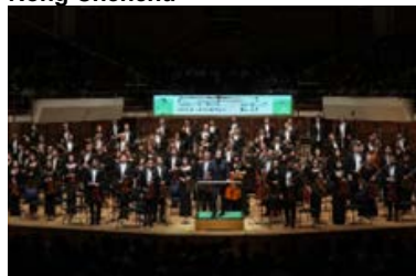
Hong Kong Philharmonic Orchestra