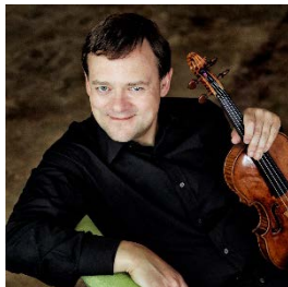
Frank Peter Zimmermann