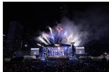
Swire Symphony Under The Stars 2023 at the Central Harbourfront