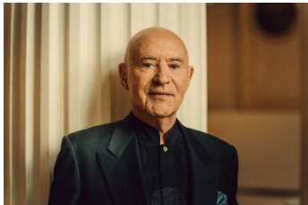
Christoph Eschenbach