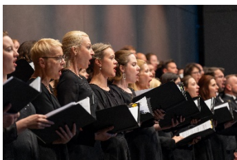
Prague Philharmonic Choir