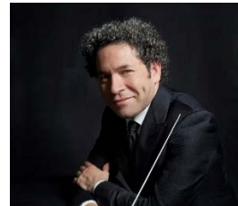
Gustavo Dudamel