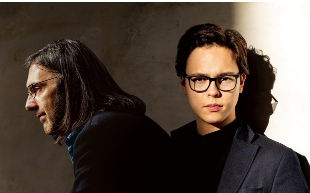
卡華高斯 Leonidas Kavakos | 佩多高斯基 Tarmo Peltokoski