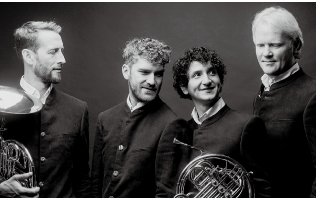
德國圓號之聲四重奏 German Horn Sound