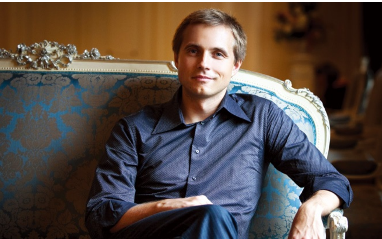
佩特連科 Vasily Petrenko