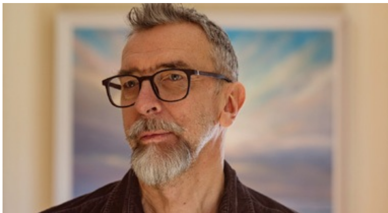
圖爾 Erkki-Sven Tüür

愛沙尼亞作曲家圖爾曾是敲擊和長笛樂師，是當今最具創意的作曲家之一，獲世界各大樂團委約作曲。這個大師班，圖爾將分享他的作曲風格、靈感泉源等，萬勿錯過！