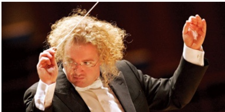
丹尼夫 Stéphane Denève

Stéphane Denève, conductor Olivier Latry, organ