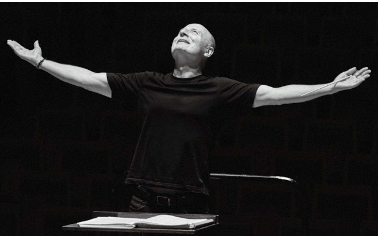
巴孚·約菲 Paavo Järvi