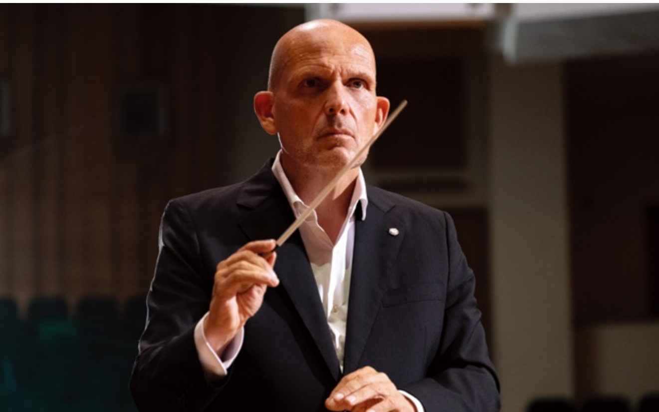
梵志登 Jaap van Zweden