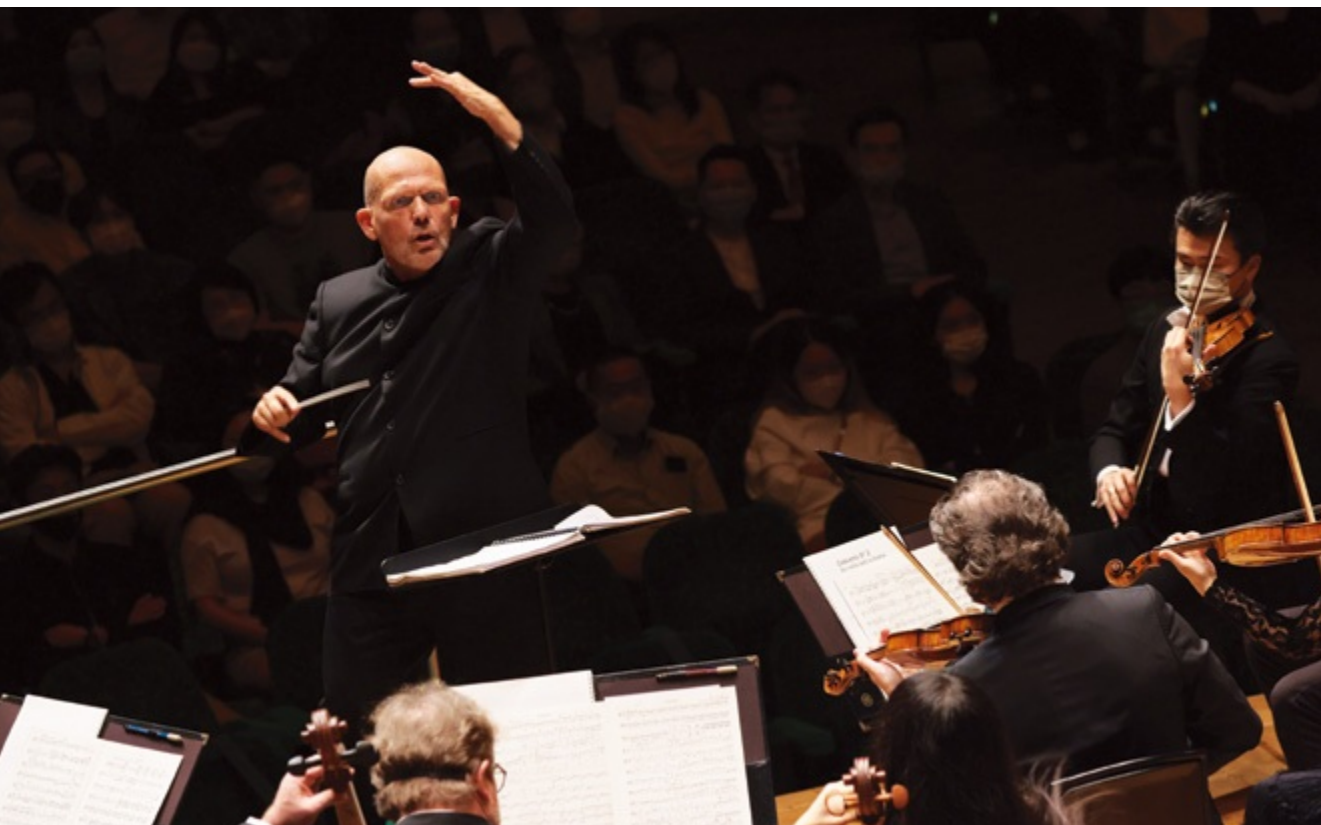
梵志登 Jaap van Zweden