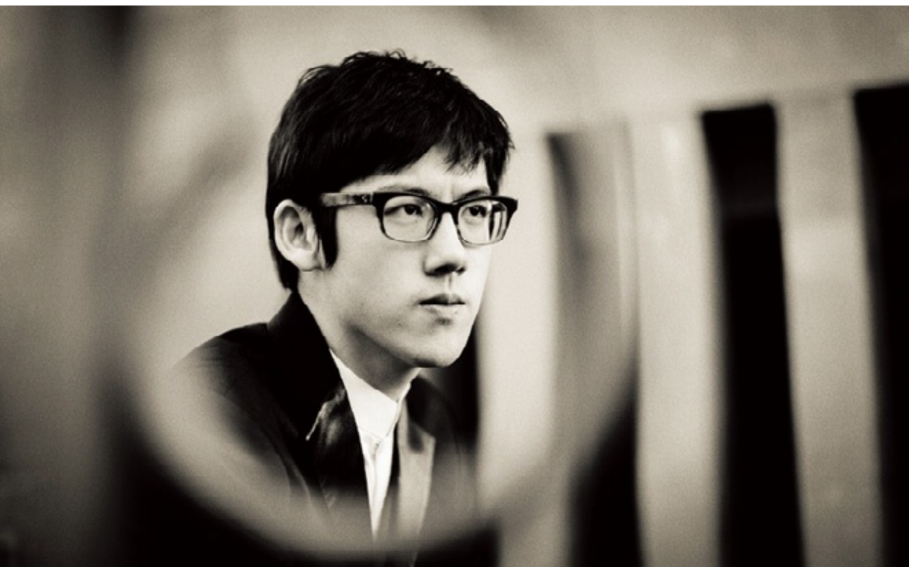
張昊辰 Zhang Haochen © Benjamin Elavega