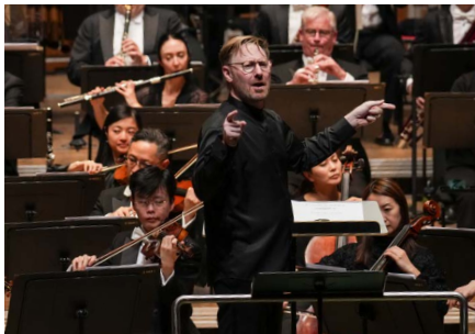
指揮羅菲 Conductor Benjamin Northey