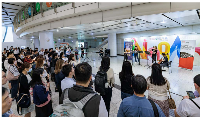
4-5 | 港樂Rhythm of the City社區演出，遊走香港各個文化地標及商場，讓美樂走進社區，慶祝樂團金禧誌慶，最後一場演出在2024年4月15日，於港鐵香港站圓滿結束。Rhythm of the City: Community Performances took place in Hong Kong's cultural landmarks and shopping malls, fitting as a joyous way to celebrate the HK Phil's 50 th birthday; it concluded with the performance at the MTR Hong Kong station on 15 April 2024.