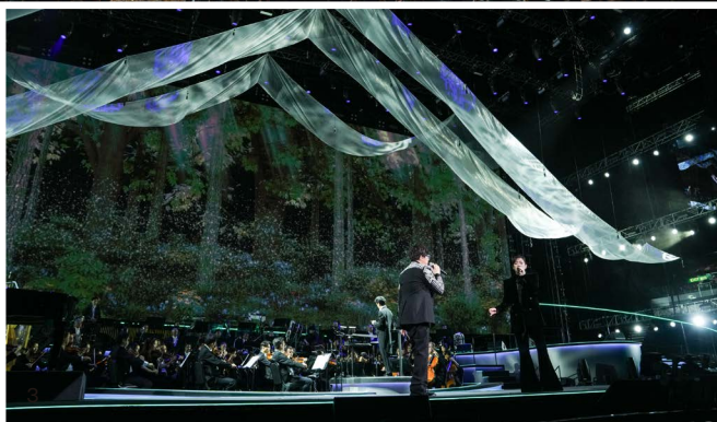
1-3 | 港樂與多位流行音樂巨星攜手，於2024年4月27日至29日假香港體育館舉行三場「中國人壽（海外）榮譽呈獻：港樂50・友弦樂聚」音樂會。The HK Phil held the celebratory concert “China Life (Overseas) Proudly Sponsors: HK Phil 50 - Symphonic Reunion” at the Hong Kong Coliseum from 27 to 29 April 2024, featuring a stellar lineup of pop singers.