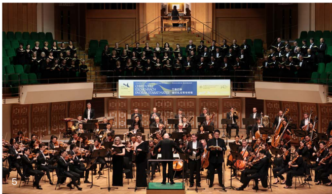
| 2 | 港樂呈獻漢斯·森瑪與積及·斯雅的《七個世界，一個星球》的香港首演 The HK Phil presenting the Hong Kong premiere of Seven Worlds, One Planet by Hans Zimmer and Jacob Shea | 3 | 余隆指揮林姆斯基-高沙可夫的《天方夜譚》 Long Yu conducting Rimsky-Korsakov's Scheherazade | 4 | 梵志登音樂總監任內最後一套音樂會，呈獻樂迷心水作品 Jaap van Zweden presenting audiences' favourite works in his final concert as Music Director | 5 | 指揮艾遜巴赫與布拉格愛樂合唱團呈獻德伏扎克的聖母悼歌 Christoph Eschenbach conducting Dvořák's Stabat Mater with the Prague Philharmonic Choir