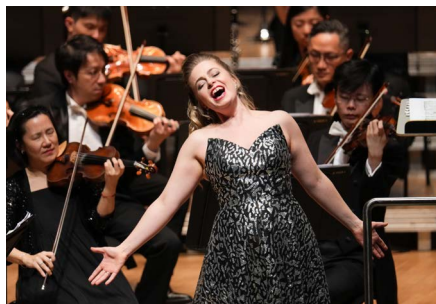
女高音施塔格 Soprano Siobhan Stagg