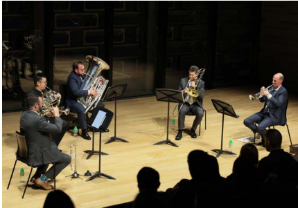
港樂 × 大館：室樂音樂會系列：情人節浪漫曲 HK Phil × Tai Kwun: Chamber Music Series: Valentine's Serenade