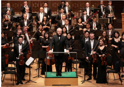
指揮漢力克 Conductor Manfred Honeck