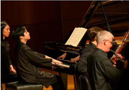
港樂 × 港大繆思樂季：藤田真央與港樂管樂首席 HK Phil × HKU Muse: Mao Fujita & HK Phil Winds