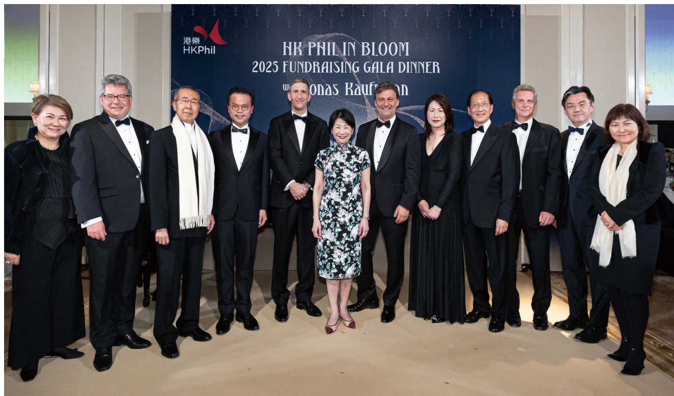
香港管弦樂團考夫曼慈善晚宴 2025 2025 Fundraising Gala Dinner with Jonas Kaufmann