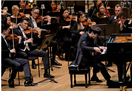
鋼琴演奏家趙成珍 Pianist Seong-Jin Cho