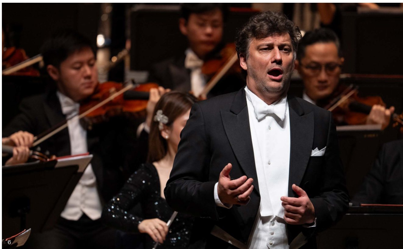
| 6 | 男高音考夫曼演唱多首歌劇詠嘆調 Tenor Jonas Kaufmann singing opera arias