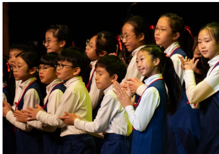
香港兒童合唱團 The Hong Kong Children's Choir