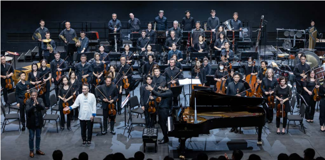
「何鴻毅家族香港基金作曲家計劃」演出 The Robert H. N. Ho Family Foundation Hong Kong Composers Scheme Showcase