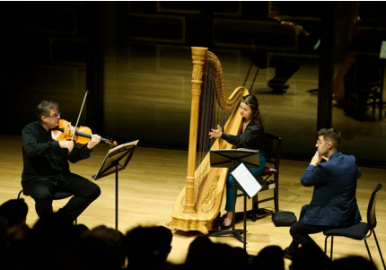
港樂 × 大館：室樂音樂會系列：從巴黎出發 HK Phil × Tai Kwun: Chamber Music Series: Voyage from Paris