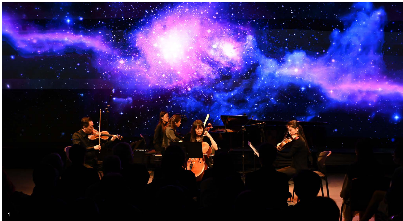
| 1 | 港樂於香港電台一號錄音室演出免費室樂音樂會，慶祝港台第四台成立五十周年

The HK Phil continues its audience building efforts through collaborations with different organisations, presenting a variety of programmes of chamber music and full orchestral works.