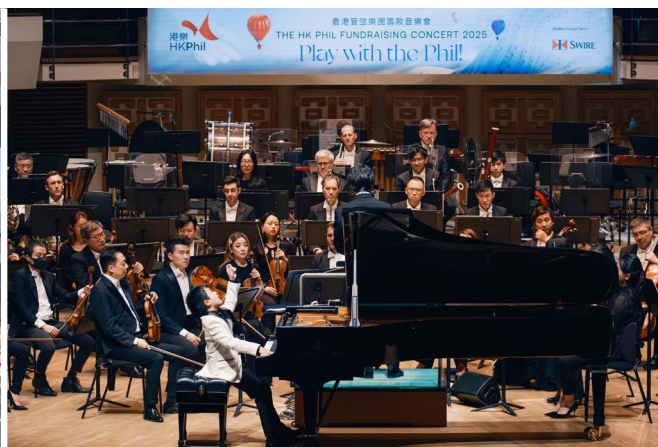
香港管弦樂團籌款音樂會 2025 The HK Phil Fundraising Concert 2025