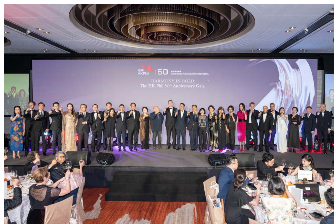
港樂五十周年晚宴 The HK Phil 50 th Anniversary Gala