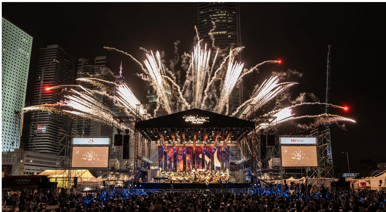
| 1 | 太古「港樂·星夜·交響曲」載譽重臨中環海濱 Swire Symphony Under The Stars returned live to Central Harbourfront.

年度大型戶外音樂盛事——太古「港樂·星夜·交響曲」——於2024年11月假中環海濱舉行，因天雨關係，11月16日的第一場演出提早結束，第二場演出則於翌日順利舉行。兩場演出吸引近二萬名音樂愛好者出席。Annual free outdoor mega-concert Swire Symphony Under The Stars was held in November 2024. The first performance on 16 November ended early due to heavy rain while the second performance on the next day proceeded successfully. The performances attracted nearly 20,000 attendees to the Central Harbourfront.