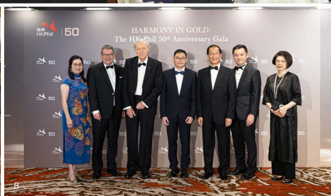
| 6-8 | 港樂於2024年6月18日假香港麗晶酒店舉行港樂五十周年晚宴，城中名人及社會賢達共超過400位來賓悉數蒞臨。The HK Phil held its 50 th Anniversary Gala Dinner at Regent Hong Kong on 18 June 2024. The event was attended by over 400 distinguished guests.