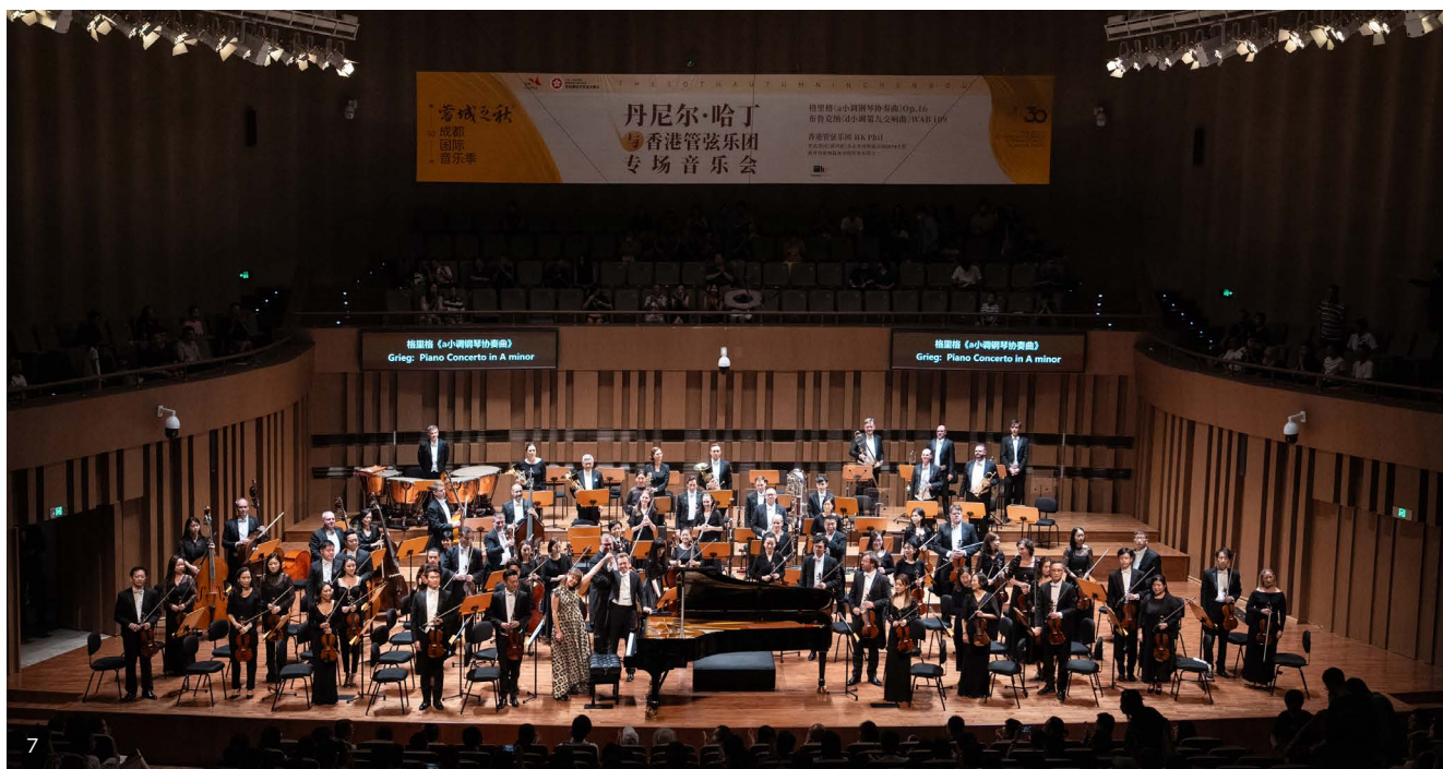
| 7 | 指揮哈丁與鋼琴家菲多洛娃於成都市音樂廳演出 Conductor Daniel Harding and pianist Anna Fedorova performing at the Chengdu City Concert Hall