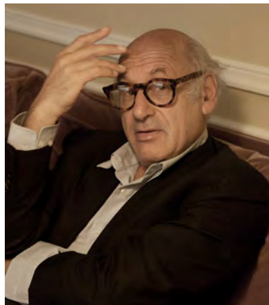
尼曼 Michael Nyman