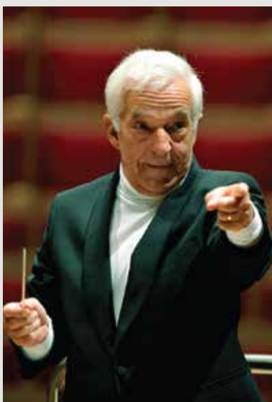
阿殊堅納西 Vladimir Ashkenazy

Last season, Vladimir Ashkenazy gave beautiful music to our city in its time of stress. He returns to close our season with Elgar's noble first symphony. By popular demand, phenomenal young pianist Behzod Abduraimov also returns, following his astounding debut with the HK Phil. Unmissable music-making.