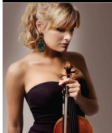
班娜德蒂 Nicola Benedetti