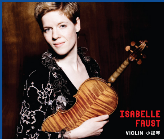
ISABELLE FAUST VIOLIN 小提琴