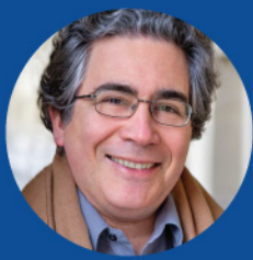
CARLO RIZZI CONDUCTOR 指揮