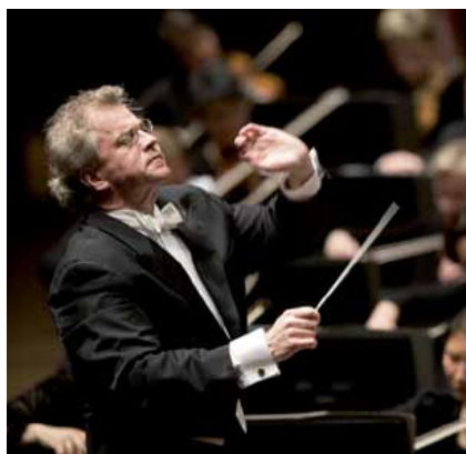
范斯克 OSMO VÄNSKÄ 指揮 conductor