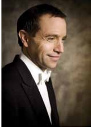
威格斯沃 MARK WIGGLESWORTH 指揮 conductor

“has a very real and admirable ability to emphasize detail and rhythmic precision without sacrificing the necessary power.” classicstoday.com