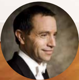
威格斯沃 Mark Wigglesworth 指揮 conductor

Two acclaimed English musicians making their HKPO débuts in these two masterpieces