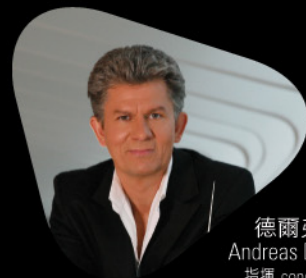
德爾弗斯 Andreas Delfs 指揮 conductor

巨星匯 Great Performers 冰鳥·火鳥 Ice Bird, Fire Bird