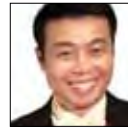
孫斌 Sun Bin